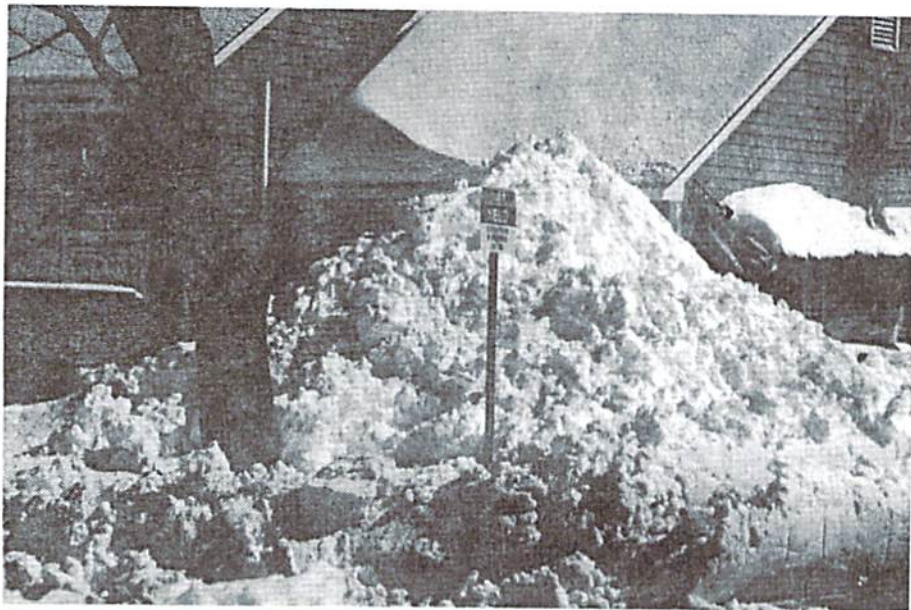
Snowplows piled a huge mound of heavy, wet snow in front of Duxbury Marketplace on Depot St.